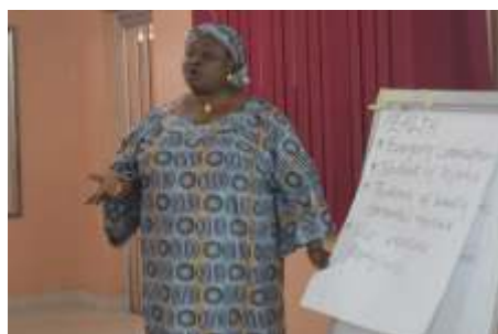
Gender and HIV Prevention Advisor making a presentation

From the 7th - 9th November 2018, USAID-funded HIFASS-LOPIN 3 organized a stepdown training to sensitize service providers on the concept of Gender Sexual Diversity (GSD) and its integration into communities, targeting young persons