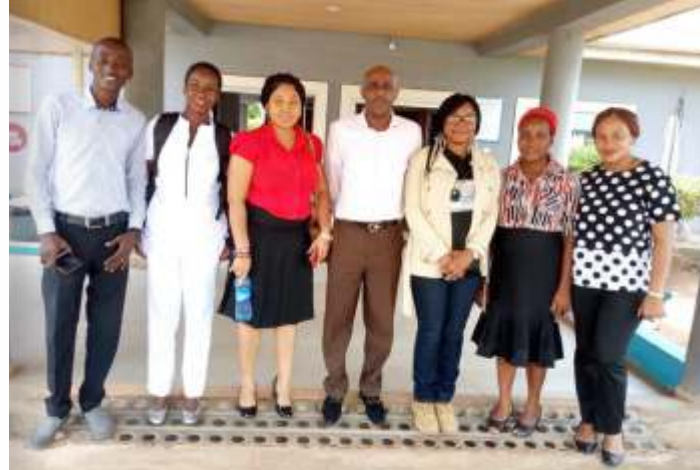
Group Photograph with some staff from 161 NAFH Makurdi and HQ staff

Considering the end of the SINMHAR Project on the 30th September 2018, HIFASS Team visited some sites to brief affected staff of the closure.