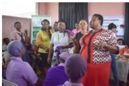
HIFASS LOPIN -3 Gender and HIV Prevention Advisor teaching giving tips on best practices for using re-usable sanitary pads.

Participants were drawn from the project's enrolled Adolescent Girls and Young Women (AGYW) as well as secondary schools in the state. Activities for the day included a Spelling Bee, training by specialized personnel on Child Protection, Gender Based Violence and other important areas, distribution of sanitary kits, books etcetera. It was an exciting experience for the young people who learnt a lot about their rights and how they can excel in life.