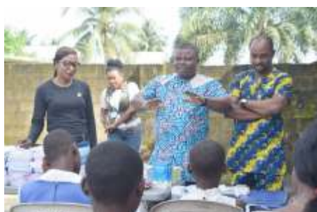
Community Mobilization/Public Private Partnership Advisor addressing participants at the event. He is flanked by the project Monitoring and Evaluation Officer (right) and the Executive Director of Perpetua Ugbang Foundation (left)

On the 28th of October 2018, HIFASS LOPIN 3 in conjunction with Perpetua Ugbang Foundation, Positive Development Foundation and Back to School Group, organized a school integration program which involved orientation of enrolled households on education and its importance, payment of sessional school fees for vulnerable children, donation of school uniforms and educational materials including textbooks, notebooks and stationery to some enrolled Orphans and Vulnerable Children (OVCs) in Calabar Municipality Local Government Area of Cross River State.