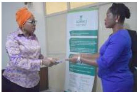
Director General, State Agency for the Control of AIDS handing over an MOU

the State Agency for the Control of AIDS which in turn handed them to the Local Agencies for the control of AIDS. The aim is to ensure the state agency will oversee the activities of the local agencies in ensuring that the enrollees are not left vulnerable but continually receive care and have access to services for sustainability; thereby ensuring adherence to treatment in line with the 90:90:90 principle.