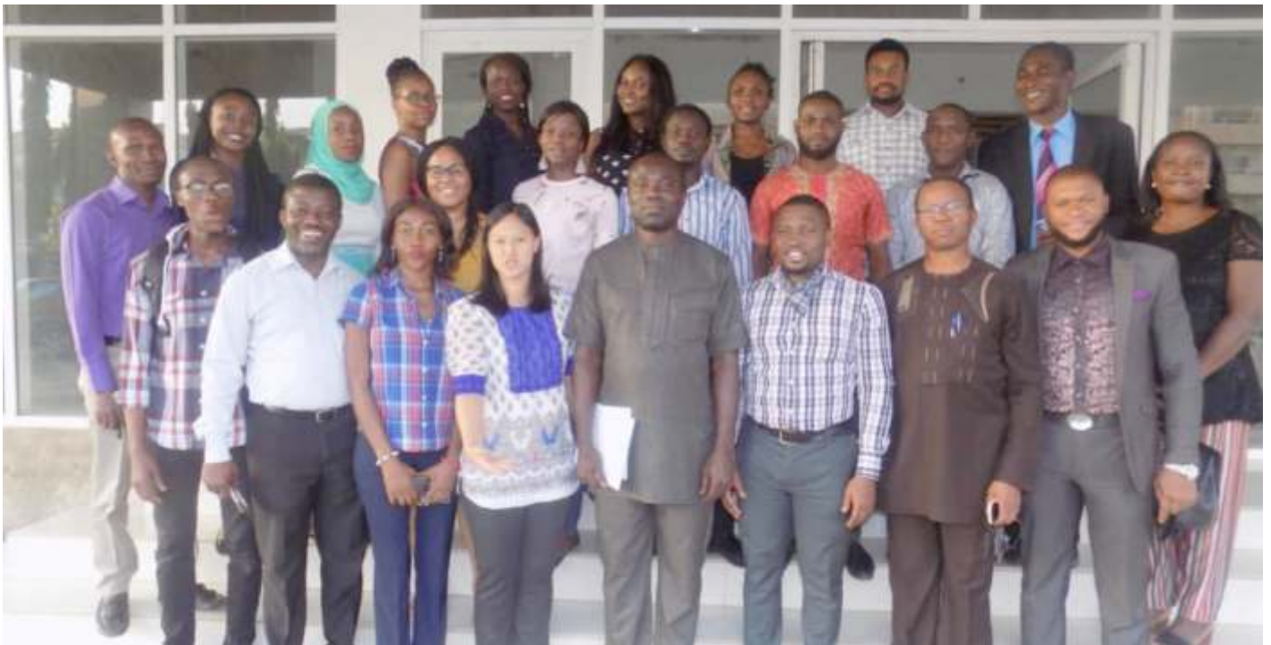
Group photograph with facilitator

At the end of the workshop the communication officer was issued a certificate of participation.