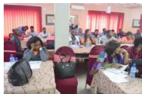
A cross section of participants at the workshop

Methodologies used were presentations, role play, group discussion and plenary sessions. A total of 43 participants made up of HIFASS LOPIN 3 project staff, representatives of sub-granted CSOs, Child Protection Network, Ministry of Women Affairs and Heartland Alliance were present and the CSOs submitted their action plans to step down the training. It is expected that by 30th December 2018, the last organization would have stepped it down to their staff and volunteers.