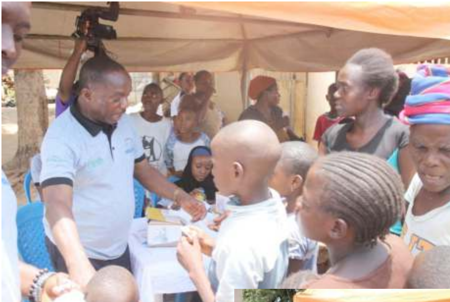
Distribution of Long Lasting Insecticide treated Nets during 2018 WMD in Abuja.

performed on 219 individuals; 61 under 5 year old children and 151 pregnant and non-pregnant women. The positivity rate of the under 5 children was 1.5%, and the pregnant and non-pregnant women was 3.9% giving an average positivity rate of 3.1%. As a preventive measure to reduce the risk of malaria infection Long Lasting Insecticide-treated mosquito nets (LLINs) were distributed to children and their mothers and pregnant women. Anti-malaria drugs were also given to those who tested positive.