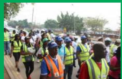
Cross section of participants during the Road Show/Walk

catching and branded T-shirts, distributing IEC materials to passers-by and by-standers, sensitizing them about the disease.