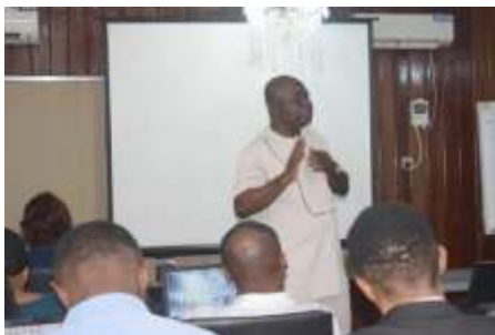
Director, Admin and Finance speaking at the event

It was an opportunity to share the new USAID guidelines on liquidation with CSO staff to improve their work. Participants were also taught how to secure their data and prepare for the final project audit which will take place in the last quarter between January and March 2018.