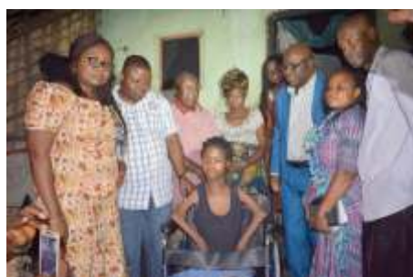
Empowerment at Calabar South