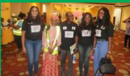
HIFASS staff at the event in Sheraton hotel, Abuja

Also, the Minister added that "the current administration places health and TB as a priority and TB is a key element of the Primary Health Care Under One Roof (PHCUOR) project.