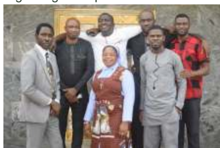
The Ebonyi state team bowing out

To mark the end of project implementation in Ebonyi state, a dissemination meeting was held on 12th September, 2018 for stakeholders in the state. Project statistics were shown to the stakeholders and feedback was received from them regarding the implementation.