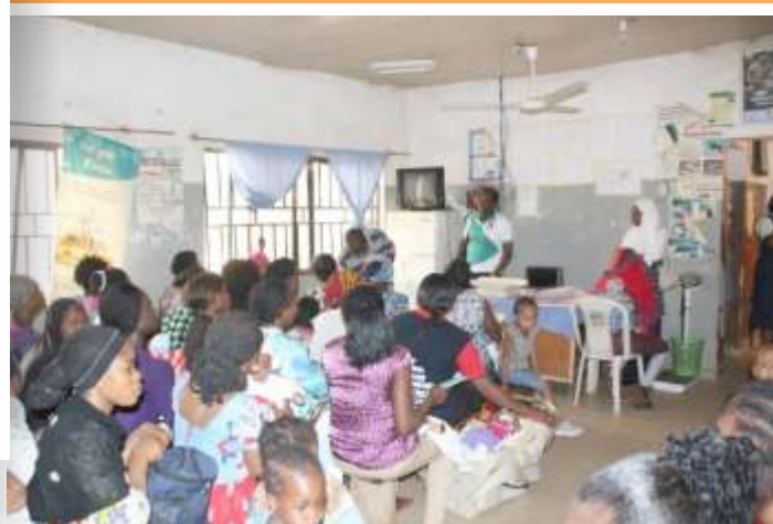
HIFASS visits Primary Health Care in Dutse, Abuja to conduct a baseline evaluation on 6th January, 2018.

The visit took place from 13th -24th July, 2018. Sites visited were DHQ MC/DRL Abuja, 44 NARH Kaduna, 161 NAFH Makurdi, 68 NARH Yaba, MH Ikoyi Lagos, 661 NAFH Ikeja and 82 DIV Enugu.