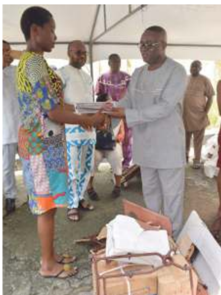
The Permanent secretary MOWA, handing over start-up materials for tailoring to a beneficiary

On the 25th of September, 2018, 13 Adolescent Girls and Young Women were given materials for business start-ups after six months of intensive training also funded by the project. Those for hairdressing got generator sets, standing hair dryers, hand held dryers, ceramic rollers, 4 in one roller sets and hair wash basins while those for sewing got Sewing machines,