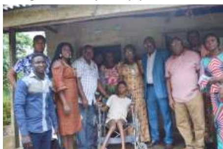
Empowerment at Idundun, Akpabuyo

On 17th August 2018, two physically challenged adolescent girls were presented with wheel chairs by the HIFASS LOPIN 3 project to enable them move around with ease and participate in activities around them. Both girls were excited and their caregivers visibly overjoyed.