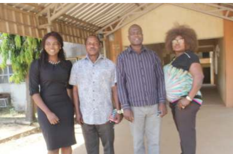
Advocacy visit to Bwari Area Council