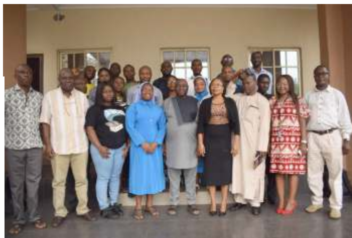
Group Photograph of HIFASS LOPIN 3 staff during the Finance and Admin meeting held in Afikpo, Ebonyi state on 25th -29th March 2018.