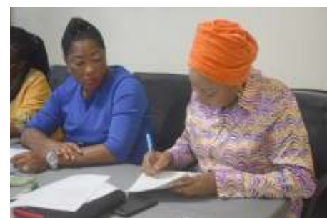
Director General, State Agency for the Control of AIDS signing MOUs

HIFASS LOPIN 3 is a five-year USAID-funded project which started off in 2014. In preparation for the final close-out in 2019; preliminary exit from certain communities took place in September 2018, but the most vulnerable households at the point of exit, which are now a minority of the total enrolled households, could not be left without follow up and continuous care.