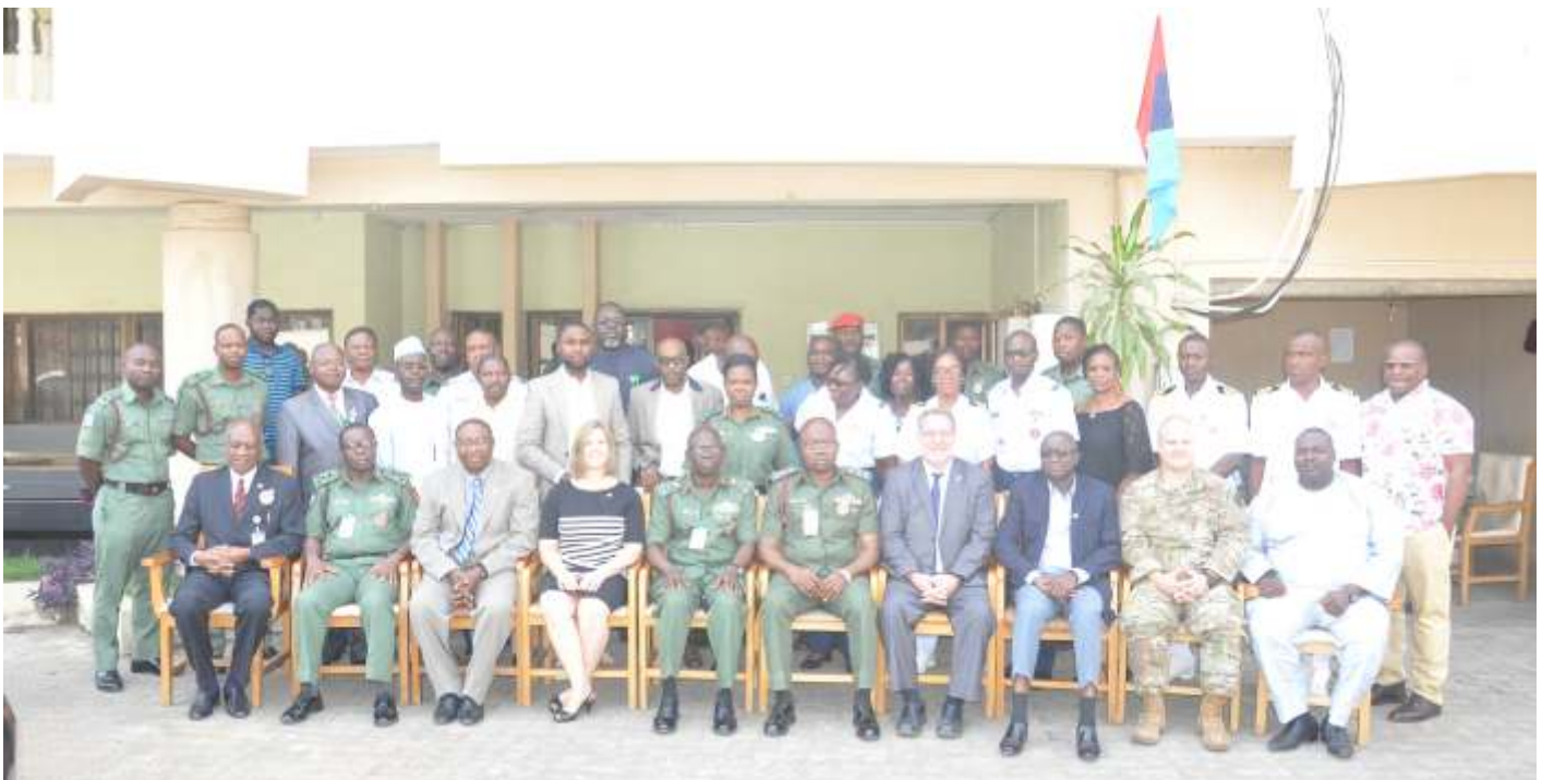
Group Photograph of attendees during the handover ceremony in Abuja on 7th January, 2019