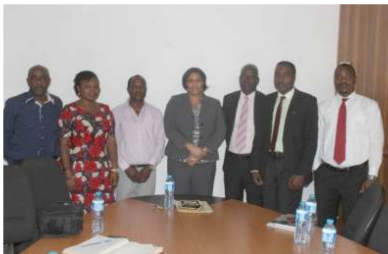
Advocacy visit to Federal Ministry of Justice