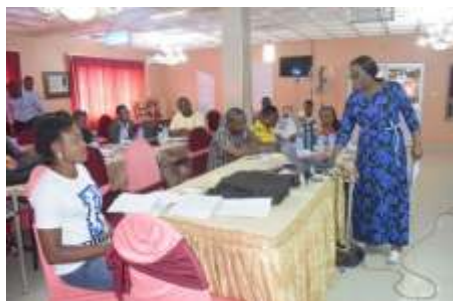
Nutrition and OVC Referral Advisor making a presentation at the event

A stepdown training on Standard Operating Procedures (SOPs) for Orphans and Vulnerable Children Referrals in Nigeria was held on the 21st and 22nd November, 2018 at the NAKs Hotel, Calabar, organized by the USAID-funded HIFASS LOPIN 3 project. Facilitation was done in collaboration with Cross River State Agency for the Control of AIDS and Ministry of Women Affairs, to build capacities of participants in using the referral package developed by 4Children in conjunction with other organizations and to form a referral network so that children and their families can receive appropriate and timely services within the state.