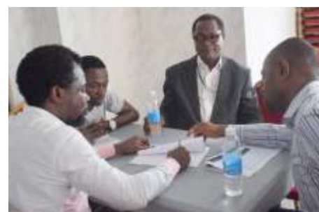
Group work at the event