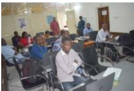
Participants at the event