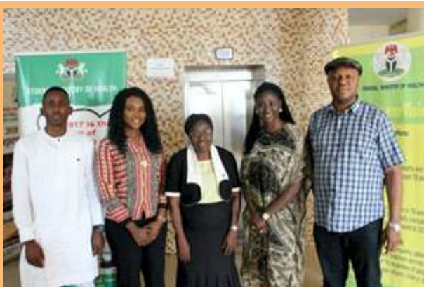
Advocacy visit to National Tuberculosis and Leprosy Control Programme (NTBLCP)