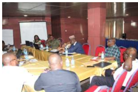
A cross section of participants at the meeting

As part of the preparations for the close out of the five years project a Work plan implementation and close-out activation process meeting was held at Top rank galaxy hotel, Abuja from 27th – 28th September, 2019. The meeting was aimed at concluding plans on the project close-out activation process.