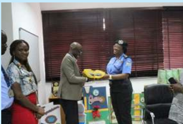
Advocacy visit to PACA-Nigeria police force