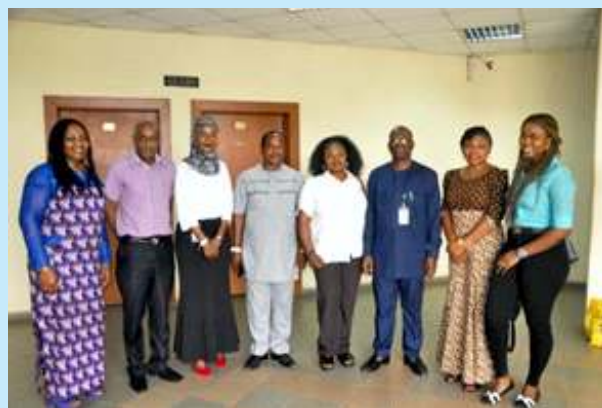
Advocacy visit to National Human Rights Commission