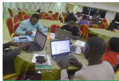
Diagnosis group during a group work

The workshop was participatory as plenary presentations were held and participants were divided into 7 groups to work on the following topics/domains, namely; Diagnosis, Treatment, Gender and Human rights issues, Childhood, Stigma and Discrimination, Prevention, Private Sector (private providers).