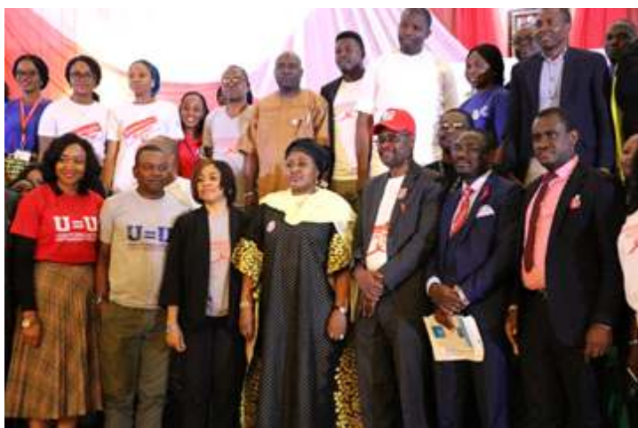
First Lady of Nigeria, Dr Mrs Aisha Buhari flanked by HIFASS team and Partners at the symposium

On 28th November 2019, HIFASS as part of the partners on the 2019 World AIDS Day attended the Adolescents and Young Persons (AYP) programme as organised by National Agency for the Control of AIDS. The event was held at the State House Banquet Hall as part of the 2019 World AIDS Day activities.