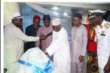
Launching of the book "Tenacity in Providence"