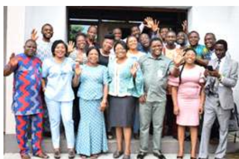
HIFASS-LOPIN3 Akwalbom State team celebrates HIFASS@12

Felicitations across various project offices/sites