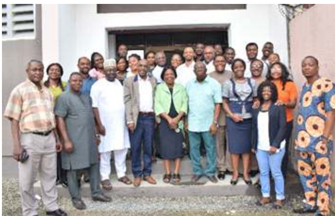
Group photograph of staff in Akwa Ibom State