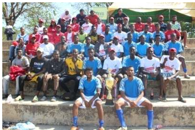
Group photograph with winners (Future Assured) of the novelty football match