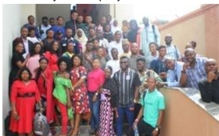
Group photo of implementing partners

As part of the closeout activities for the GF-HIV-NFM extension project, an external stakeholder's closeout meeting was held for all implementing partners on 19th June, 2019 at Stanzel Grand Resort, Abuja. The aim of the meeting was to update stakeholders on the progress in the implementation of the change ideas models amongst HIV Vulnerable and high risk Adolescent Girls and Young Women (AGYW), Men Sleeping with Men (MSM), Female Sex Workers (FSW) and People Who Inject Drugs (PWID); and to obtain feedback from stakeholders on GF-HIV-NFM extension phase implementation. This meeting served as the close-out ceremony for the project in the FCT.