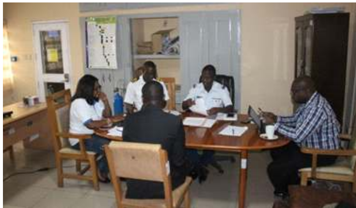
Recruitment exercise being conducted at NMOD-HIP, Abuja