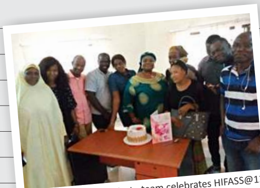
HIFASS-LOPIN3 Kano State team celebrates HIFASS@12