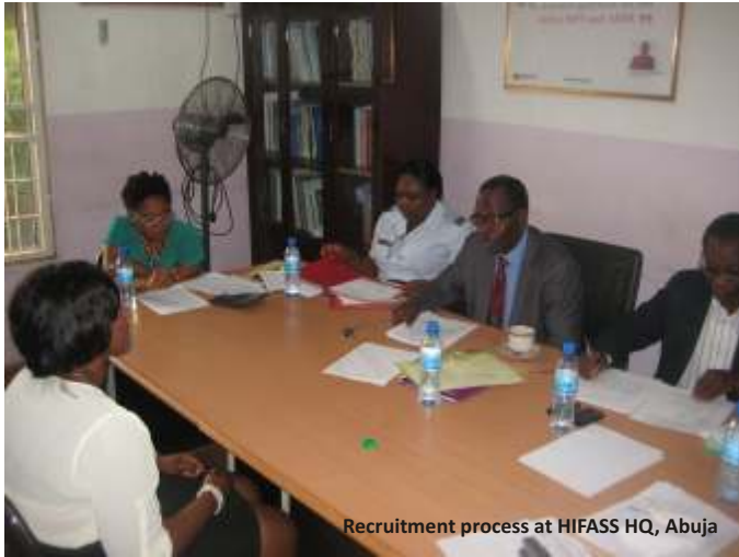
Recruitment process at HIFASS HQ, Abuja

SINM-HAR- For several years, HIFASS has been recruiting skilled health professionals to establish free and comprehensive HIV care and prevention services for the benefit of all Nigerians in 24 NMoD program sites across the country. In the last one year HIFASS has employed 10 new staff to cover 7 sites. The positions include Snr Pharmacist, Lab Scientist for RV 329,352 and M&E Officer/DES at 68 NARHY, Lab Assit for RV at 368 CHC Yaba, Study Nurse and Study Coordinator at DHQ MC, Lab Scientist at DHQ MC, Medical Officer 68 and Medical Records officer NARH Yaba. M&E Officer/DES at 45NAFH MK, Program Administrative Specialist at 345AMH Kaduna, Medical Officer II at Military Hospital PH, Medical Officer II at 82 DIV Enugu, Prog Pharmacist and Pharmacist Tech at 45 NAFH Makurdi.