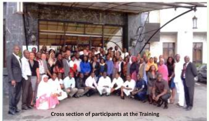
Cross section of participants at the Training

"The workshop was very enlightening and was a good avenue to network with other NGO representatives. I came to understand that as an NGO, complying with the new and updated rules will affect our ability to win grants"