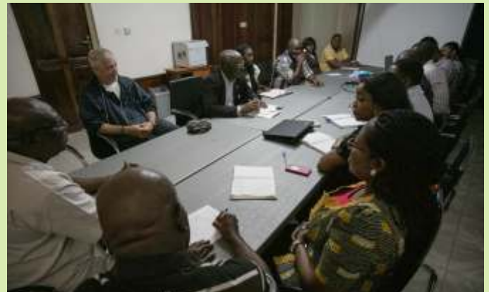
Entry meeting with the visiting team at HIFASS LOPIN-3 project office, Calabar

A team of supervisory team and communication experts from Project HOPE and HIFASS visited Cross River and Ebonyi State in the week of September 14 2015 to conduct field visits to some of our sites in Cross Rivers and Ebonyi States under the LOPIN-3 project with a view to gathering evidence-based information for fundraising and communication for the project. The visit gave an opportunity for both teams to be fully immersed in the needs LOPIN-3 addresses exposing the team to the hardest parts of what LOPIN-3 does. Several interviews were conducted on women, children and families who are in need of services and those who are benefitting from and participated in the services and care that LOPIN-3 provides and supports.