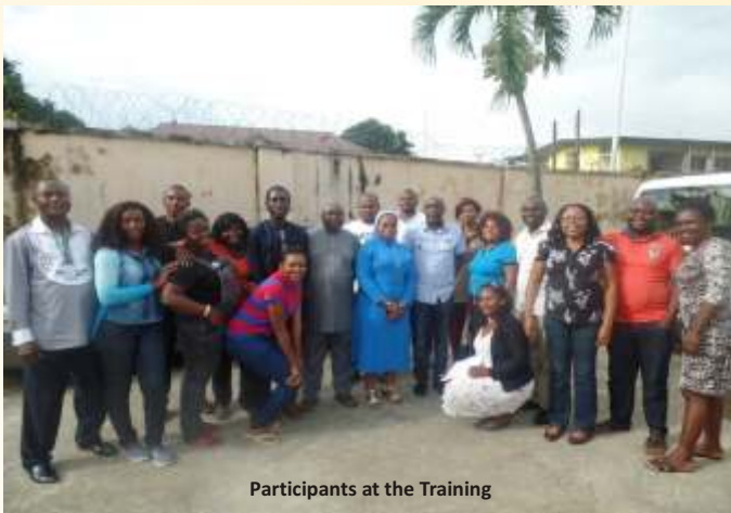
Participants at the Training

The training was facilitated by Fajasco Nigeria Limited to train LOPIN-3 Project staff. The training comprised of 18 participants drawn from HIFASS, SUCCDEV and CAACA. This selection was based on job functions; members of staff who currently handle or can assist in administrative functions, and those who work in the Finance unit.