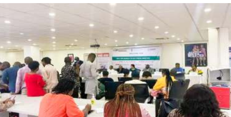
Pre-world Tb day press briefing; Hifass was part of the strategic planning and communication Committee

Throughout the 2023 World Tuberculosis (WTB) Day celebrations, HIFASS, alongside the National Tuberculosis and Leprosy Program (NTBLCP) and various partners, joined forces to organize and implement a series of activities. We actively participated in key events such as the pre-World TB Day press briefing, the road show, the ministerial press briefing, and the community outreach efforts.