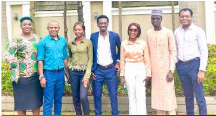
MPOX TEAM at Health Innovation Center,