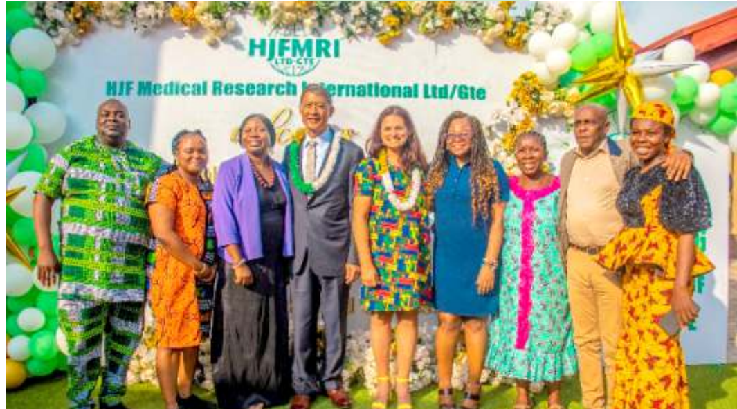
HJF, HIFASS, and other guests at the event Abuja

On September 28, 2023, a significant milestone was achieved as HJF Medical Research International Ltd/Gte. (HJFMRI Ltd/Gte.) celebrated the grand opening of its new laboratories and office complex in Abuja, Nigeria. Named the Health Innovations Centre (HIC), this state-of-the-art facility is strategically located in the heart of the Federal Capital